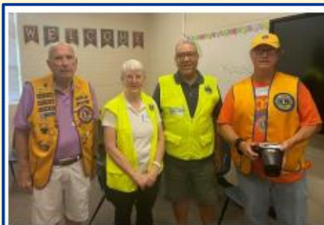
Norton Park-180 students